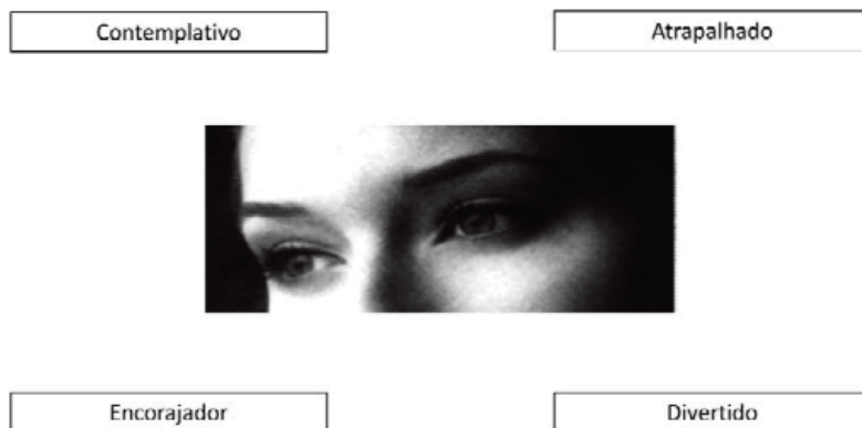
Figure 1. Item 15 of the Portuguese RMET used in this study. The target mental state, in this case, is Contemplativo

Figure 1 shows item 15 of the Portuguese version we developed, and all other items were presented in similar fashion. Answers were collected by means of mouse clicking on the desired option. The test had no time limit.