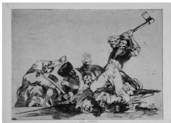
Painting 2, Goya: Lo Mismo, from the series Disasters of War, 1810-1820 https://mfas3.s3.amazonaws.com/objects/SC13071.jpg