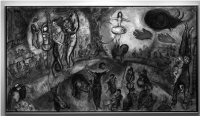
Painting 6, Chagall: Le Grand Cirque, 1927 http://www.sothebys.com/content/dam/stb/lots/N09/N09740/348N09740_3JC BV.jpg