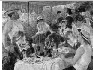
Painting 3, Renoir: Le Déjeuner des Canotiers, 1881 https://upload.wikimedia.org/wikipedia/commons/b/b7/Pierre-Auguste_Renoir_-_Le_D%C3%A9jeuner_des_canotiers.jpg